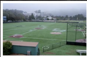
» Left: It's not hard to identify a field that has drainage problems. Water will collect on the surface and not disperse.